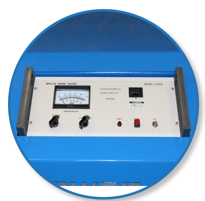
Integral Clinton Sparktesters