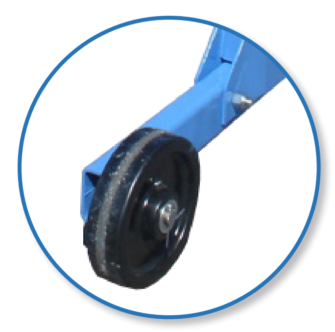
Heavy duty wheels