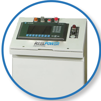
Main control pedestal