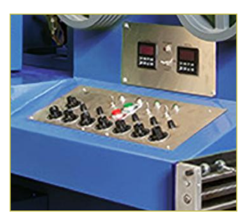
Operator Friendly Control Panel