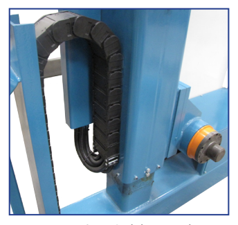
Protective Cable Tracks