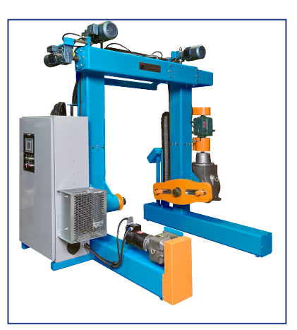
GTU-30 115 Inch Cap