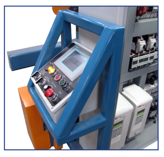
Guarded Contol Panel