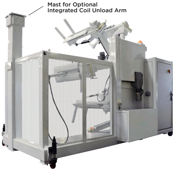
Mast for Optional Integrated Coil Unload Arm