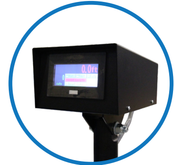
ELECTRONIC STOP TO LENGTH COUNTER