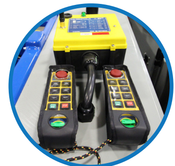
OPTIONAL WIRELESS REMOTES