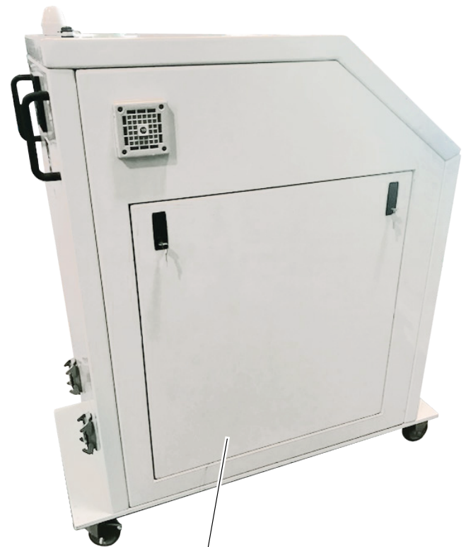
EASY ACCESS SAFETY INTERLOCK DOORS