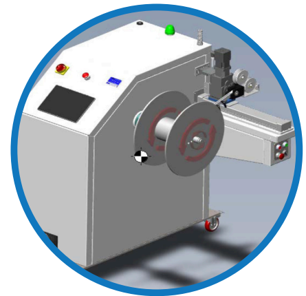
SSTU SHOWN WITH SPOOL