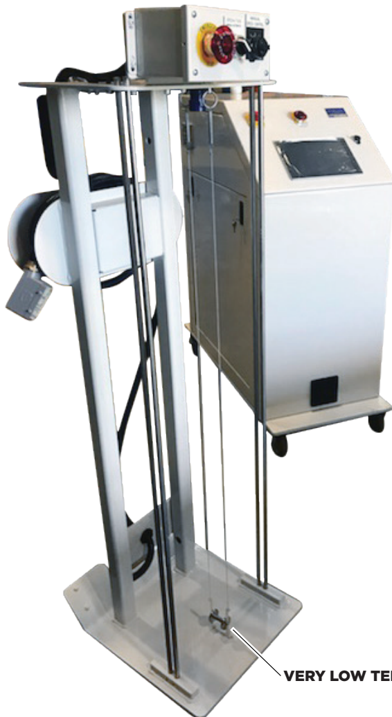
VERY LOW TENSION DANCER

Single Shafted Take Up - Low Tension Applications