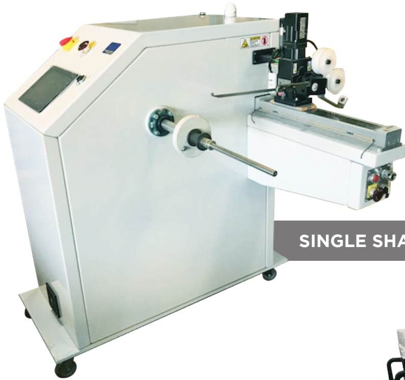
SINGLE SHAFTED TAKE UP

Single Shafted Take Up - Low Tension Applications