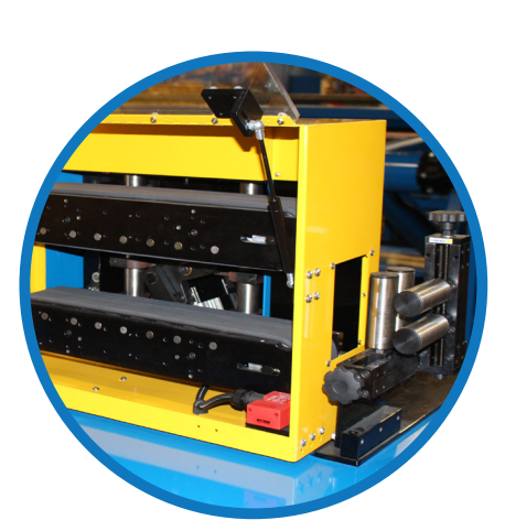
PULLER AND EXIT MATERIAL GUIDE