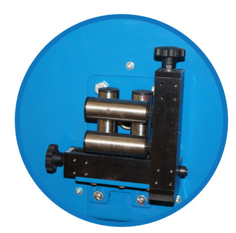
INLET MATERIAL GUIDE