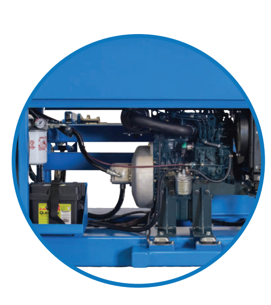
22 HP Electric Start Diesel Engine