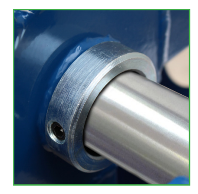
Standard 2 1/8" Locking Reel Collar