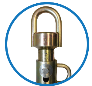
ADJUSTABLE SWIVEL HEAD