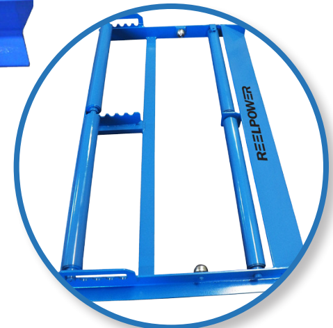
Model RRP-480DW HD