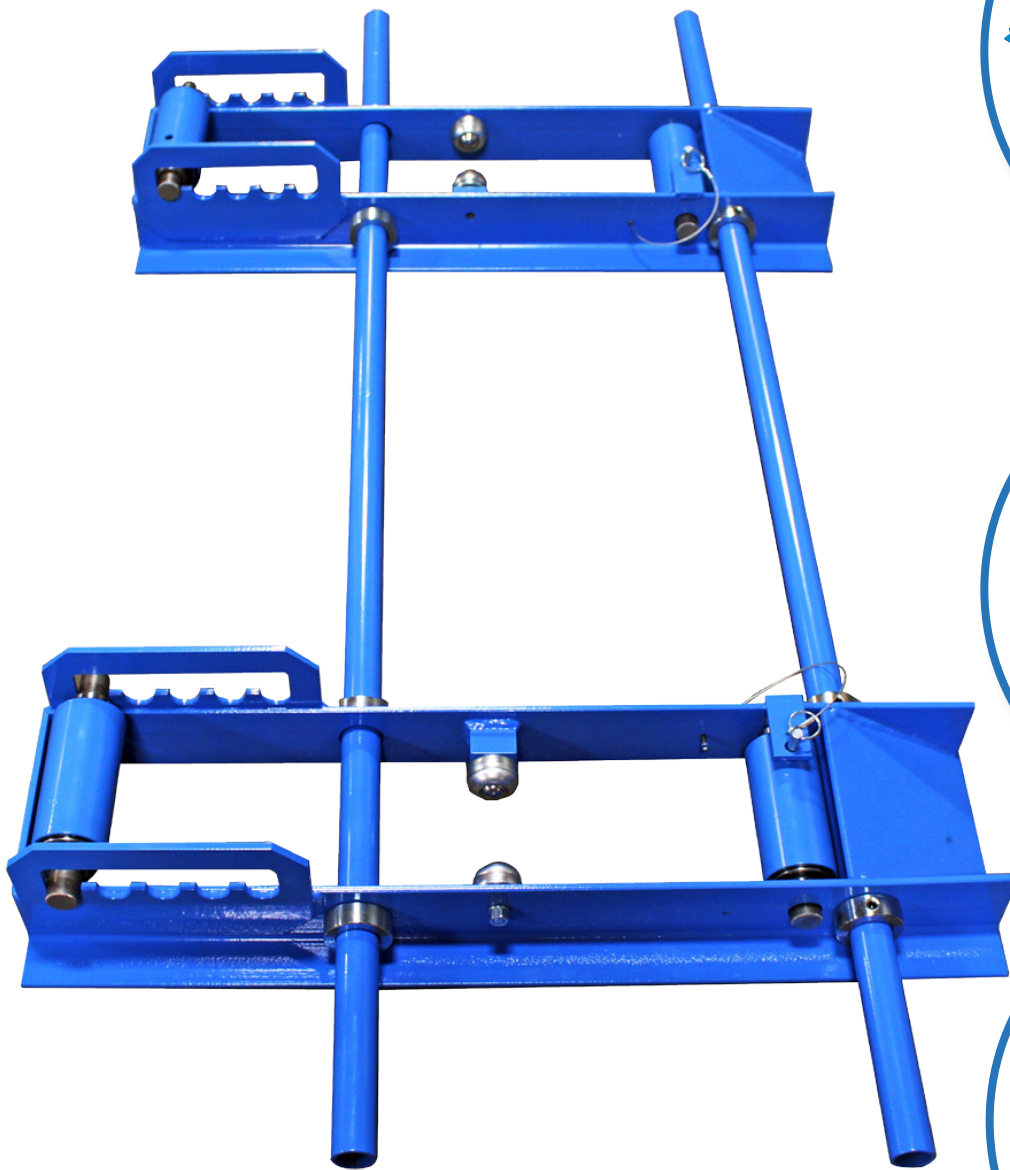
Model RRP600S-01 shown