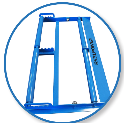
Model RRP-480WD HD