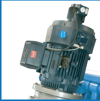
AC Vector Precision Drives