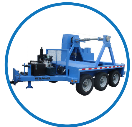
POWERED RRT 15