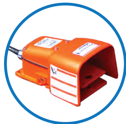
OPERATOR SAFETY FOOT SWITCH