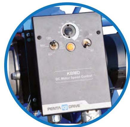
VARIABLE SPEED DRIVE