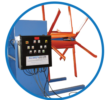
PC-500 WITH POWER TRAVERSE