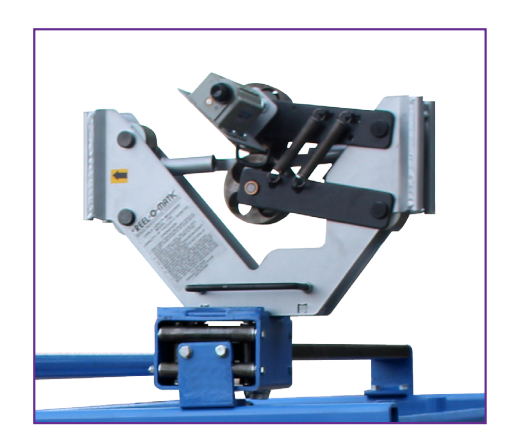
Model 1700SP Meter and Slide Traverse