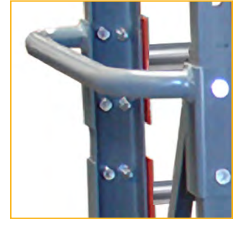
Push Handles for Steering