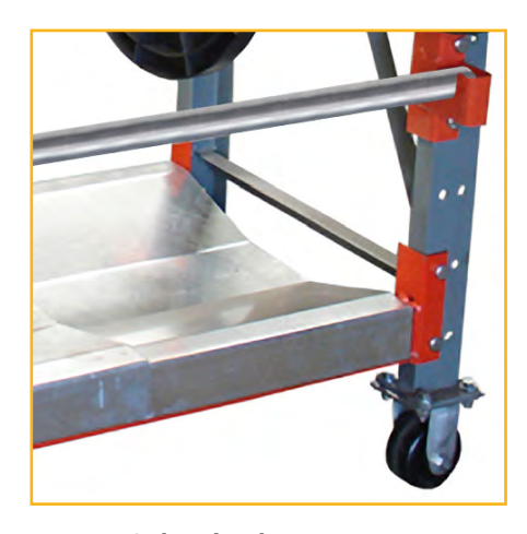
Galvanized Lower Tray