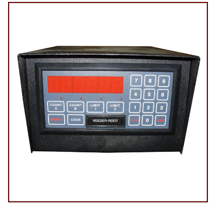
Electronic Stop-to-Length Counter