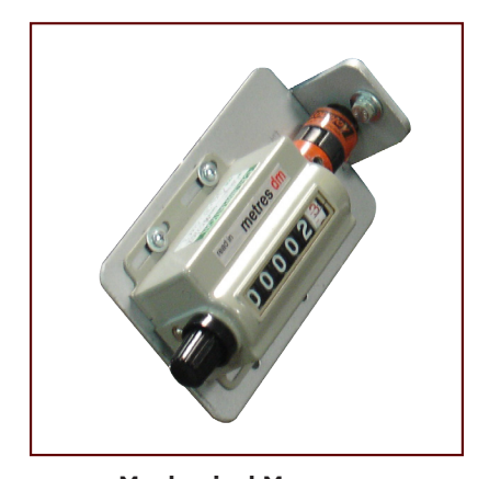
Mechanical Measurer (Imperial or Metric)