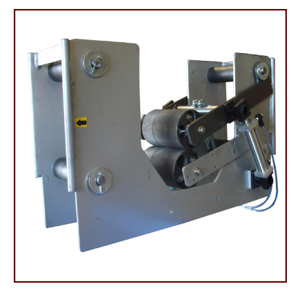
1706 with Pneumatic Cylinders