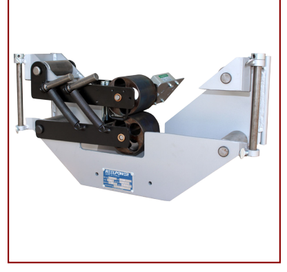
1704 Side Load Measurer

A fairlead for improved accuracy when measuring material under 1/2" diameter is provided. When not in use, the fairlead swings away in a second's time.