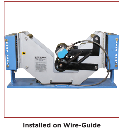
nstalled on Wire-Guid with Encoder