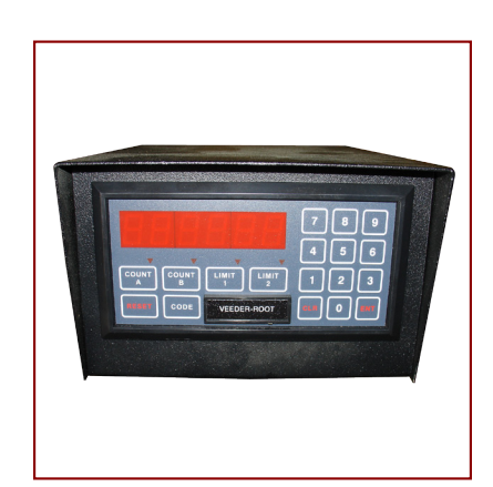
Electronic Stop-to-Length Counter