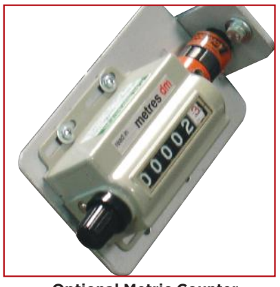
Optional Metric Counter