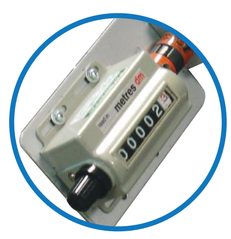
OPTIONAL METRIC COUNTER