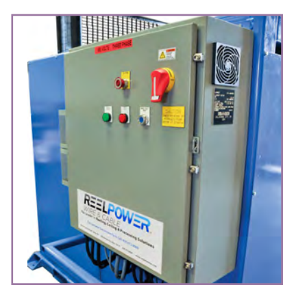
UL-508 Panel Box