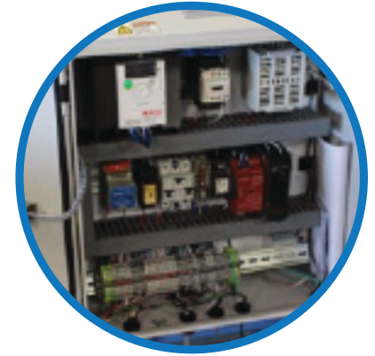
UL CERTIFIED PANEL BOX