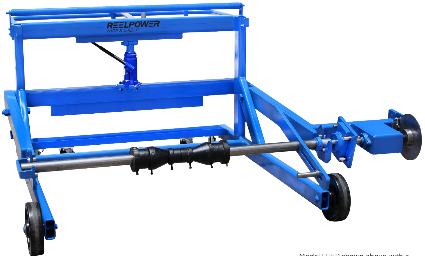
Model HJ5P shown above with a 10" mechanical tension brake

Recommended for use with paying out material from supply reels. The HJP can improve the efficiency of your reel and cable handling operation. By utilizing a hydraulic jack (standard) or ElectroLift, reels can be raised and lowered with ease, using minimal manpower.