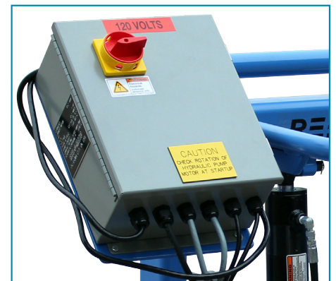
120 Volt Panel Box