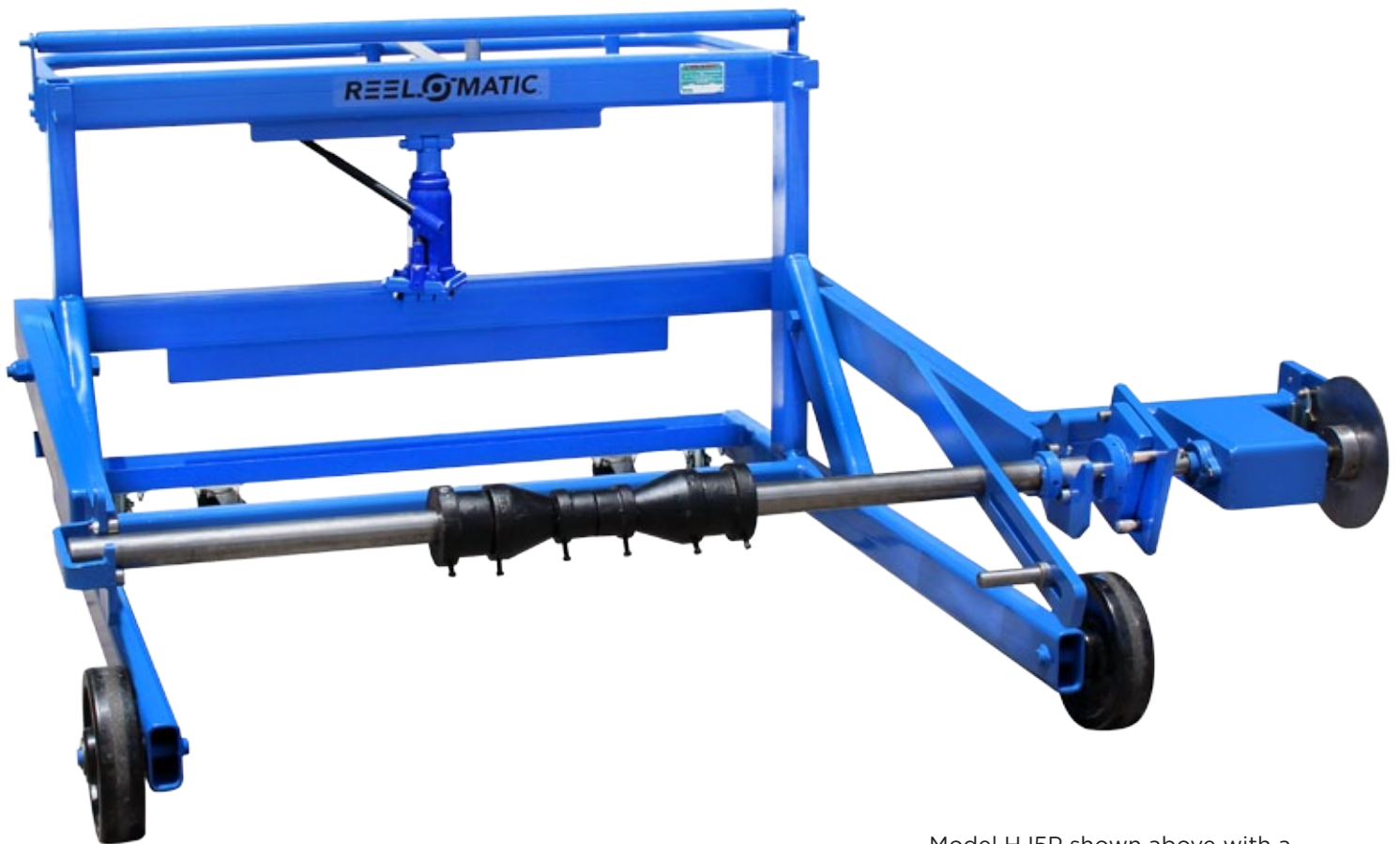
Model HJ5P shown above with a 10" mechanical tension brake

The HJP can improve the efficiency of your reel and cable handling operation. By utilizing a hydraulic jack (standard) or ElectroLift, reels can be raised and lowered with ease, using minimal manpower.