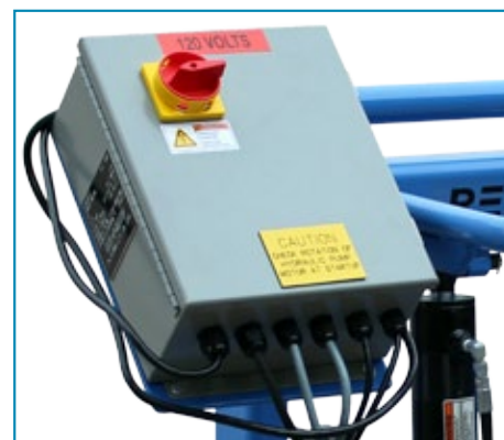
120 Volt Panel Box