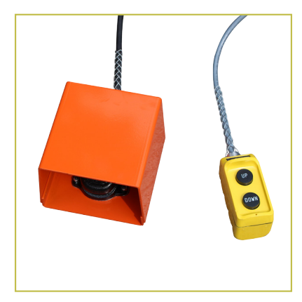
Foot Pedal & Hand-held Pendant