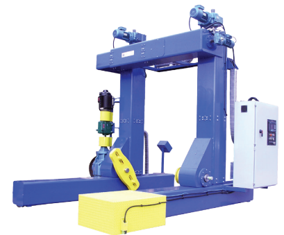
GTU-50 Load Side Rim Driven Systems Available