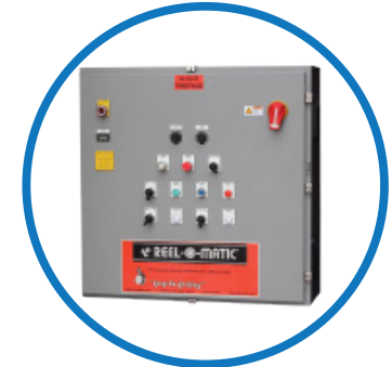
UL PANEL BOX