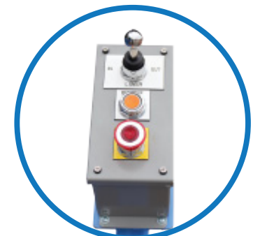
FRONT MOUNTED CONTROL STATION