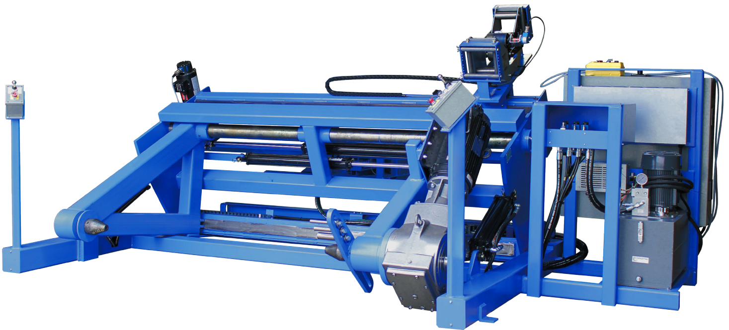
FMT10 shown above 10,000 lb. Shaftless Take-Up

Heavy duty floor mounted shaftless take-ups provide you with improved productivity, reducing processing time.