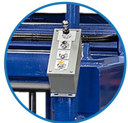
DUAL STATION LOADING CONTROLS