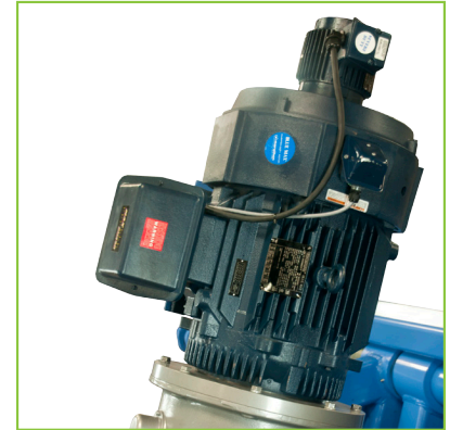
AC Vector Precision Drives