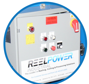
REAR MOUNTED CONTROLS