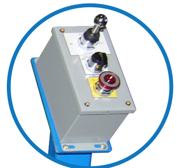
RIGHT ARM CONTROLS