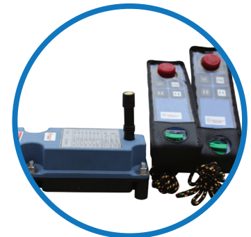
WIRELESS REMOTE PENDANT