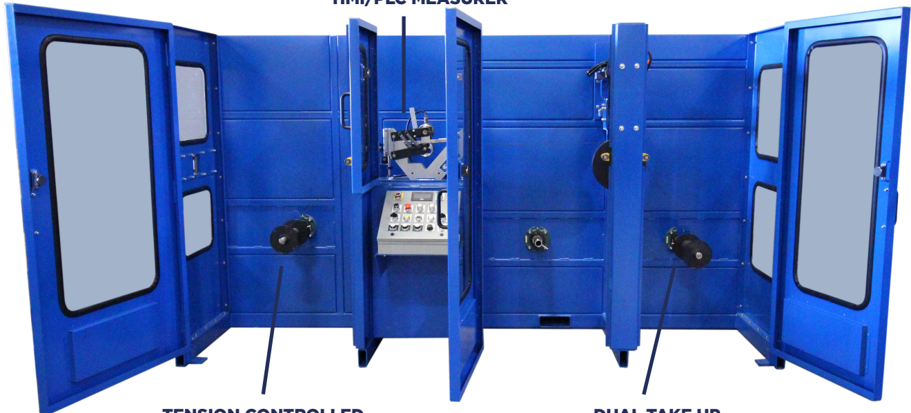
TENSION CONTROLLED PAYOFF