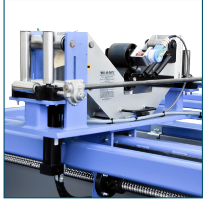
Automated Slide Traverse