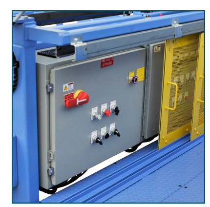
UL Approved Control Box