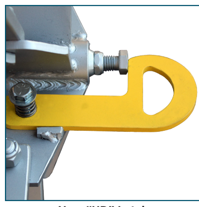
New "HD" Latch

*Removable Sideplate Coilers Custom Made as Ordered