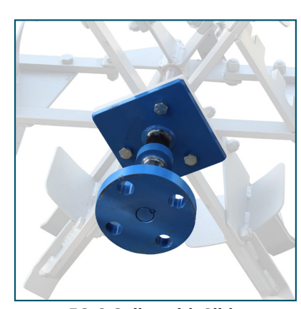
5C-6 Coiler with Slide Drive Adaptor