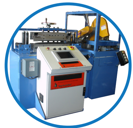
CTL CAT2 INTEGRATED WITH AUTOMATIC CHOP SAW