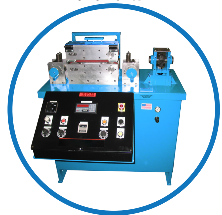
CTL200B INTEGRATED WITH AUTOMATIC HYDRAULIC CUTTERS