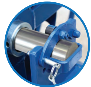
STANDARD SHAFT SAFETY LOCKS

*Shown with 2" shafts 3" & 4" arbor bushings are available.