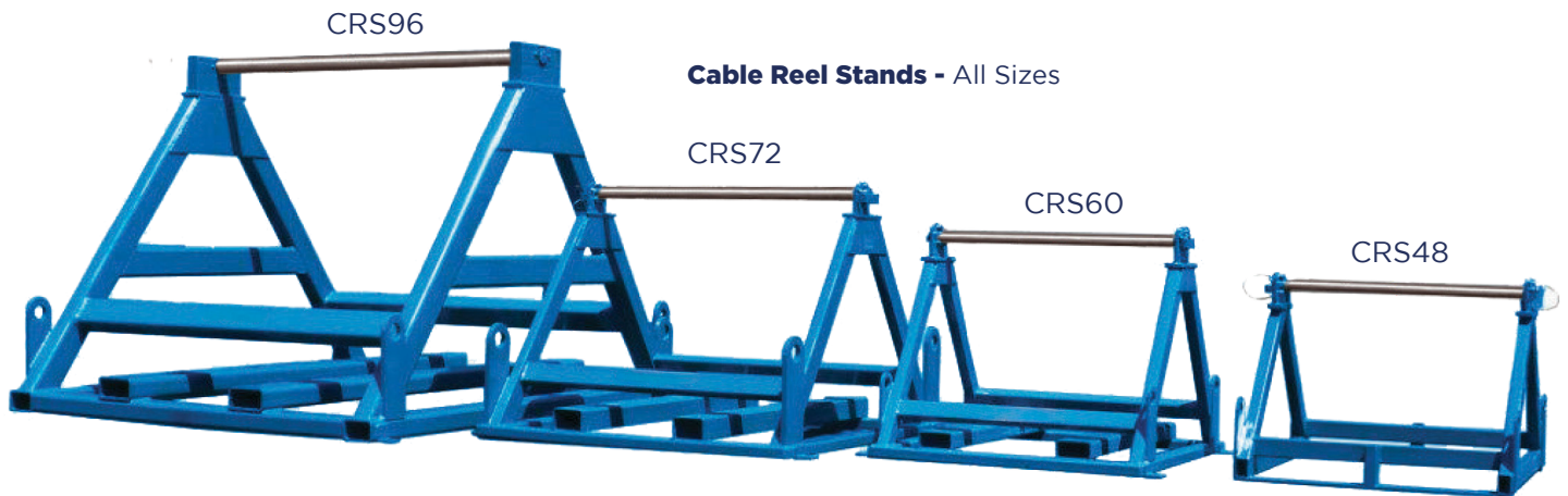
Cable Reel Stands - All Sizes

CRS - Your Stand for Large Reeling Solutions