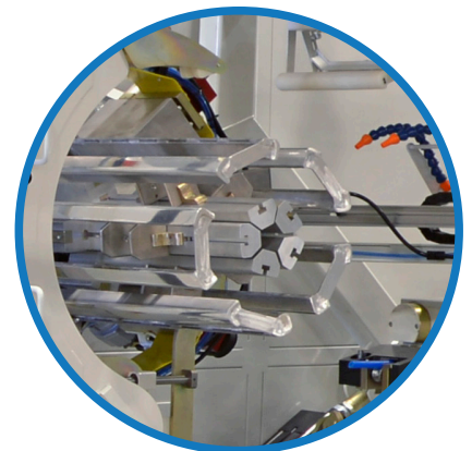
AUTOMATED COILING HEAD