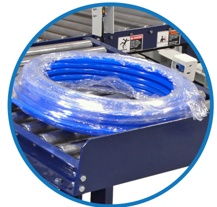
AUTOMATED STRETCH WRAP