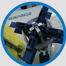
AUTOMATIC COILING HEADS