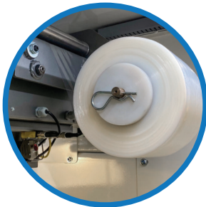
TRAVERSING STRETCH WRAP CARTRIDGE UP TO 21" WIDE.