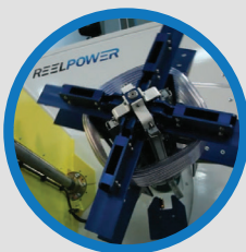
AUTOMATIC COILING HEADS