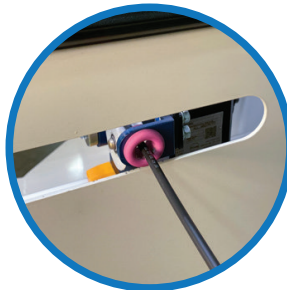
REPLACEABLE ENTRANCE PRODUCT GUIDES