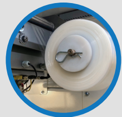
AUTOMATIC STRETCH WRAP