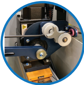
ARTICULATE GUIDE SERVO AXIS