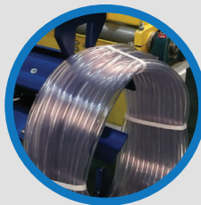
AUTOMATIC BANDING AND EJECTION