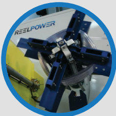
AUTOMATIC COILING HEADS