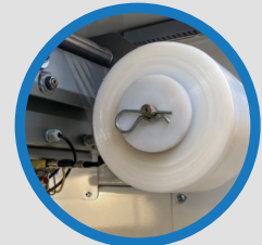
AUTOMATIC STRETCH WRAP

Reel Power Industrial designs and builds a wide range of material handling equipment for hose, tube, pipe, wire and cable industries – including coilers, haul-offs/caterpullers, payoffs, take-ups, accumulators, linear measurers, rewind/test lines, twinner/quadders, concentric and eccentric taping lines, spiral striping machines, control upgrades and many specialty items. Please visit us at reelpowerind.com to learn more.