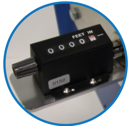
COUNTER AVAILABLE IN FEET & INCHES OR METERS & DECIMETERS