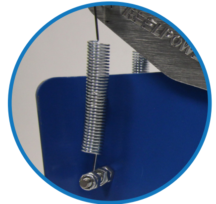
ADJUSTABLE TENSION SPRING SETTINGS