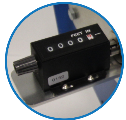
COUNTER AVAILABLE IN FEET & INCHES OR METERS & DECIMETERS