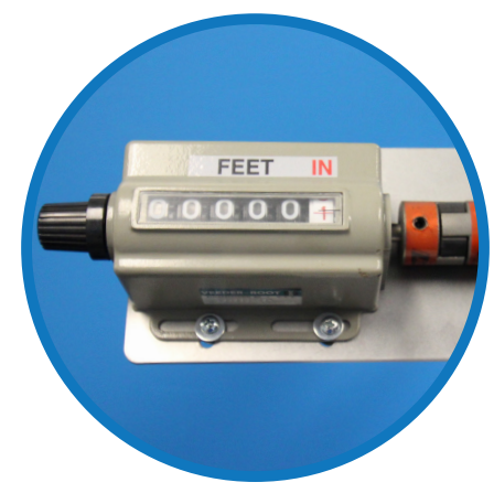
COUNTER AVAILABLE IN FEET & INCHES OR METERS & DECIMETERS